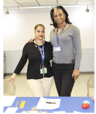
April was Alcohol Awareness Month. Staff from Elmhurst conducted education during the month to raise community awareness about alcohol abuse issues.