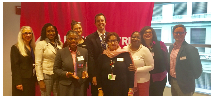
NYC Health + Hospitals/Elmhurst's Making Strides Team Leaders at the American Cancer Society's Thank You Celebration for Health + Hospitals at the Hope Lodge.